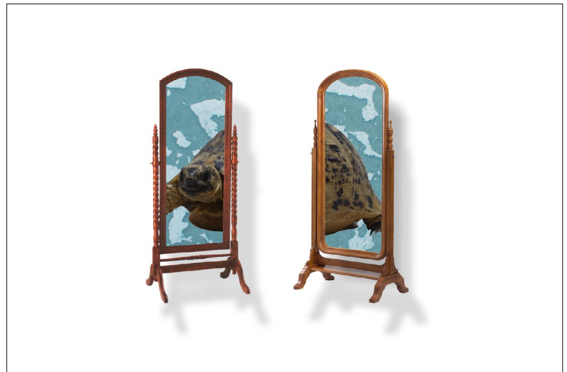
Curated by Anita Spooner