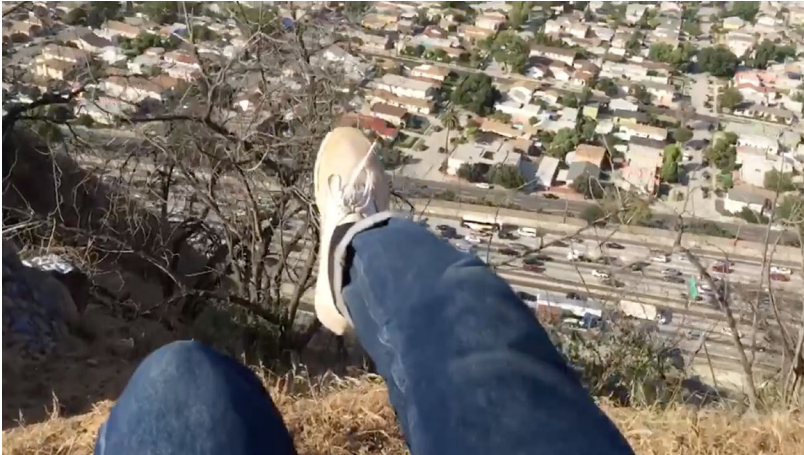
Curated by Salome Oggenfuss

Story Corpse is a curated film modeled after the surrealist practice of Exquisite Corpse drawing. Participants are asked to contribute a scene after viewing the scene preceding. As the film unfolds perpetually, individual authorship becomes less important. Rhythms and patterns establish themselves independently of the author's intentions.